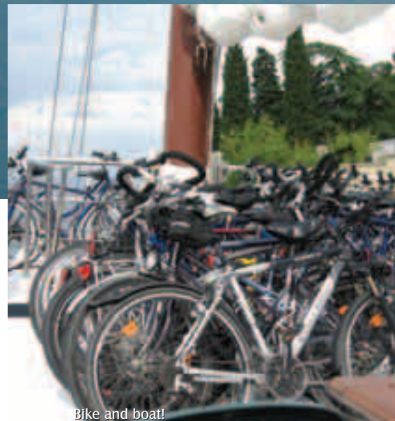
Bike and boat!